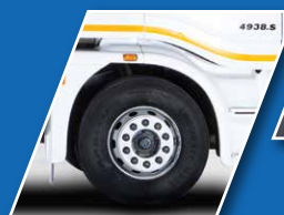
Jake Brakes & ABS