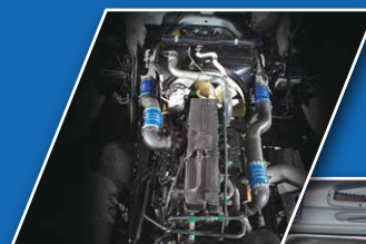
High Performance Cummins Engine