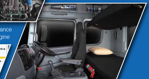
Breakthrough Cabin Design