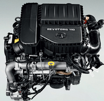
1.5L Revotorq Diesel Engine (260 Nm torque)

All-new petrol and diesel engines with powerful & sporty performance. Turbocharged, with a power output of 110PS (80.9kW) to set your heart racing.