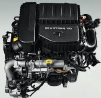
1.5L Revotorq Diesel Engine (260 Nm torque)

All-new petrol and diesel engines with powerful & sporty performance. Turbocharged, with a power output of 110PS (80.9kW) to set your heart racing.