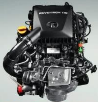
1.2L Revotronic Petrol Engine (170 Nm torque)

Cornering stability with anti-lock braking system and electronic brake-force distribution in all 4 wheels with hydraulic assistance for emergency braking.