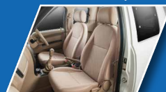
Acclaimed Cabin Design