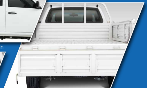
Spacious Cargo Deck